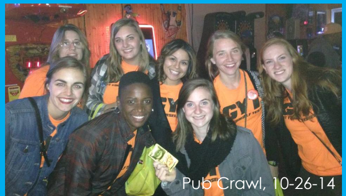
Pub Crawl, 10-26-14